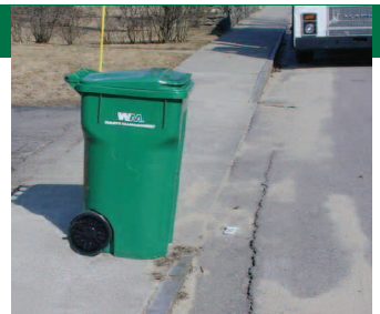
Proper placement of your cart

overhead. The cart should be no more than 3 feet away from the curb or road edge, and the arrows on the lid must be pointing toward the street, with the hinges facing away from the street. Your recycling bin should be placed at least 3 feet from your trash cart.