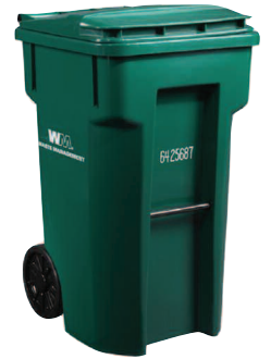
Your green cart is for trash only.